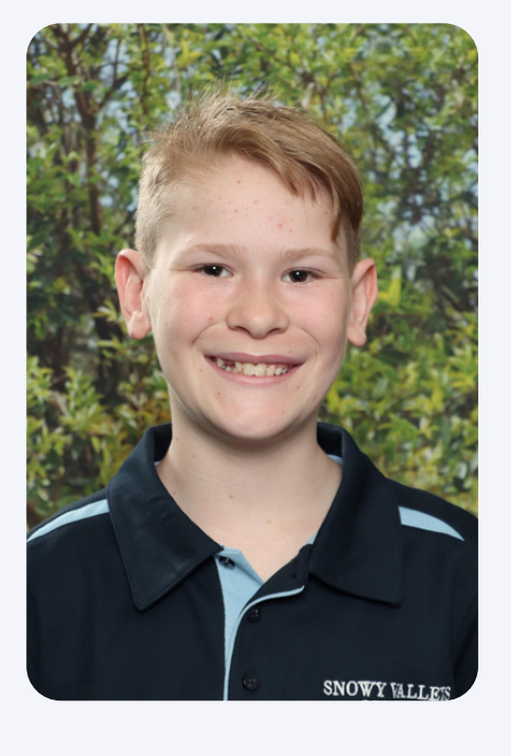
SNOWY VALLEY! SCHOOL