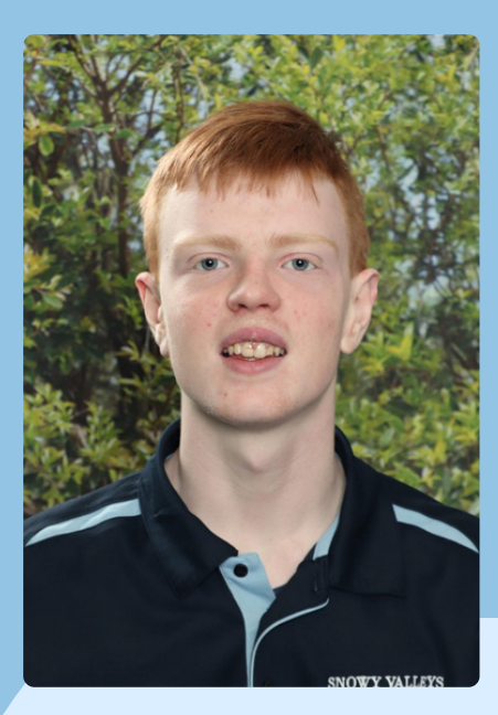
Class 5 Representative: