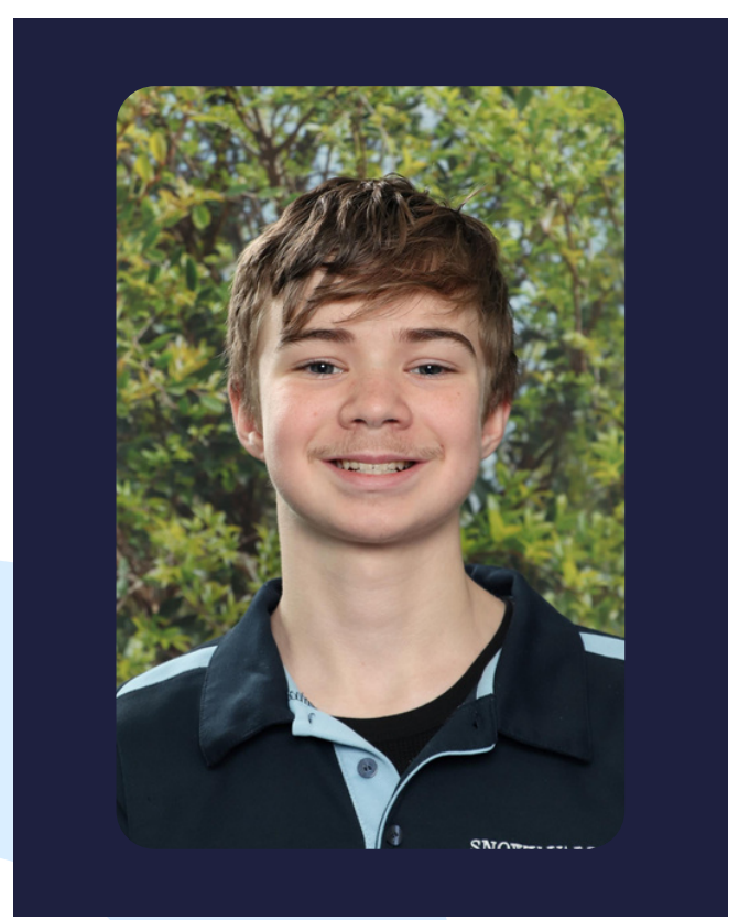
Week 5: Angus