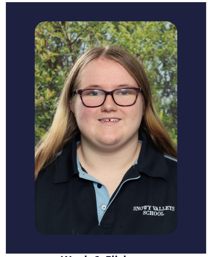
Week 6: Elisha